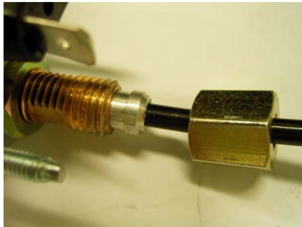
4. Insert airline, cone and nut.