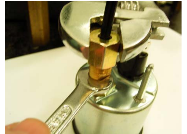
6. Tighten nut until airline hose is firm in place, using spanner/shifter as per picture above