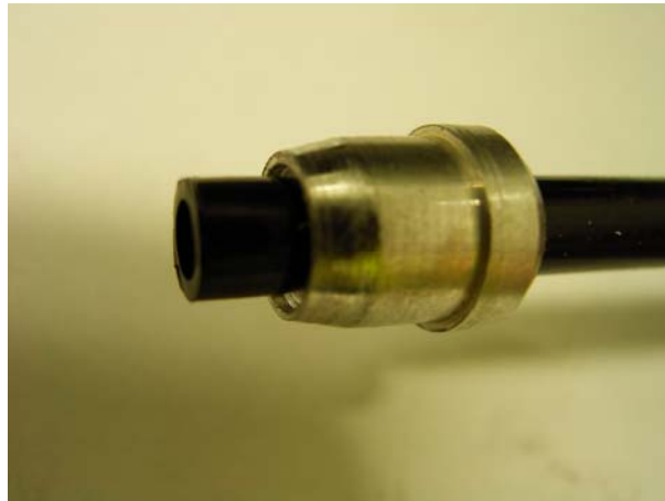
2. Cone direction