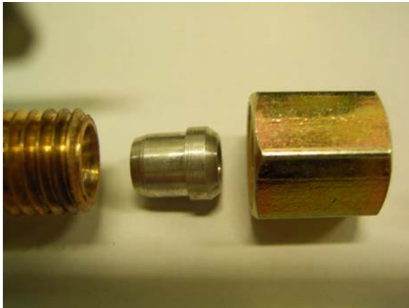
1. Gauge – Cone - Nut