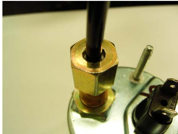
5. Tighten nut until firm