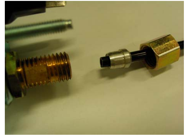
3. Ready for insertion